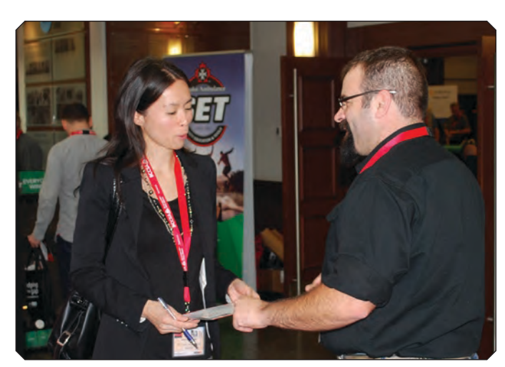
Consultation at Bridging the Gap Conference

As in previous years, the Regional Safety Advisor (RSA) initiative once