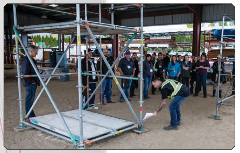
Falls Workshop Practical Session

visits in all regions of the province to provide advice and assistance to contractors on everything from preparing for COR to answering questions about safety regulations and legislation. They also continued the successful collaboration with WorkSafeBC to raise awareness of injury management/return to work initiatives offered by both organizations.