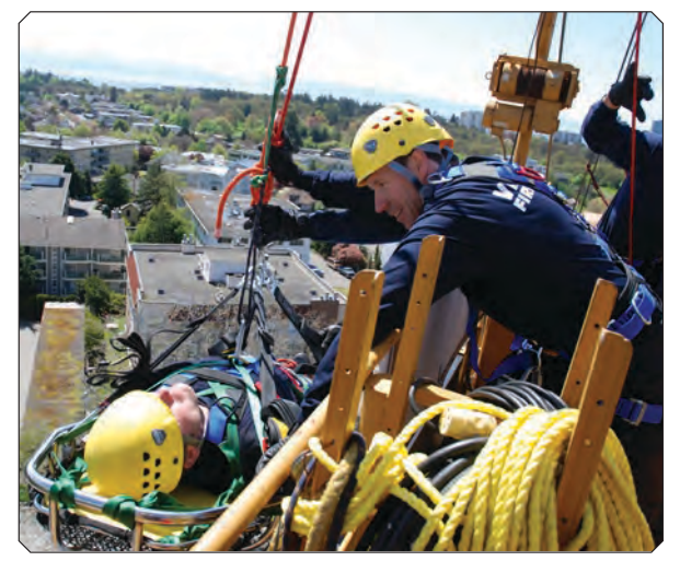
Technical High Angle Rope Rescue Program (THARRP)

funding for which is administered by BCCSA. THARRP is a five-course, train-thetrainer program offered by select BC fire departments to prepare personnel to rescue individuals who are working at heights (e.g., tower-crane operators). As of December 31, 2016, five construction site worker rescues were carried out, 149 instructors in 34 fire departments received a total of 25,303 training hours, and 140 tower-crane site surveys were conducted.