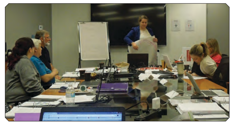
TCP Instructional Skills Workshop

We began revising the TCP re-qualification course – a process that included sponsoring a one-day workshop/information session to obtain feedback and ideas on planned content. On hand were representatives from traffic control companies, the Ministry of