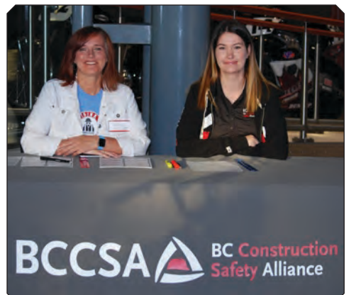
Vancouver Contractor Breakfast - May 2016

The BC Construction Safety Alliance is a not-for-profit association that provides services to over 40,000 construction companies employing approximately 180,000 workers. Recognized by WorkSafeBC, we are funded by industry through WorkSafeBC annual assessments and are governed by a Board of Directors whose members represent all sectors of the industry: residential, road building, aggregate, ready-mixed, industrial, commercial, institutional, and heavy construction, representing both open-shop and union contractors.